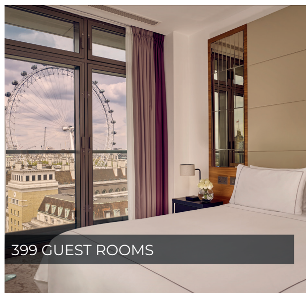
399 GUEST ROOMS